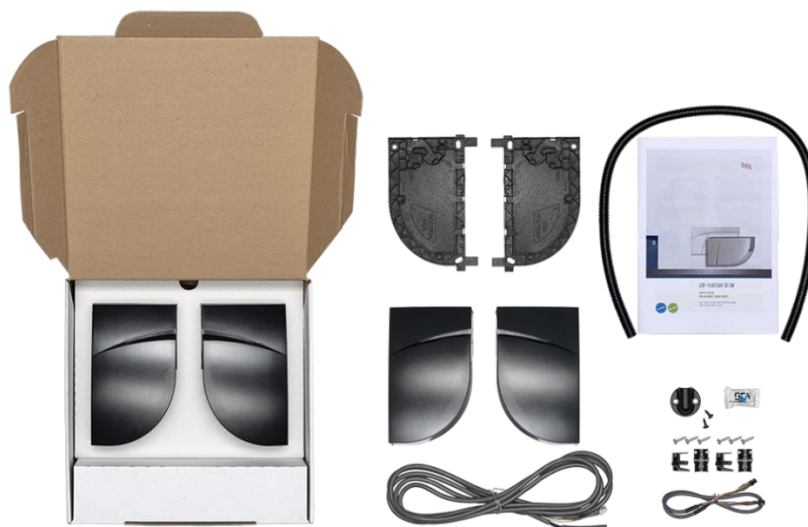
LZR®-FLATSCAN 3D SW KIT EQUIPMENT