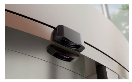
Ceiling or surface mounting