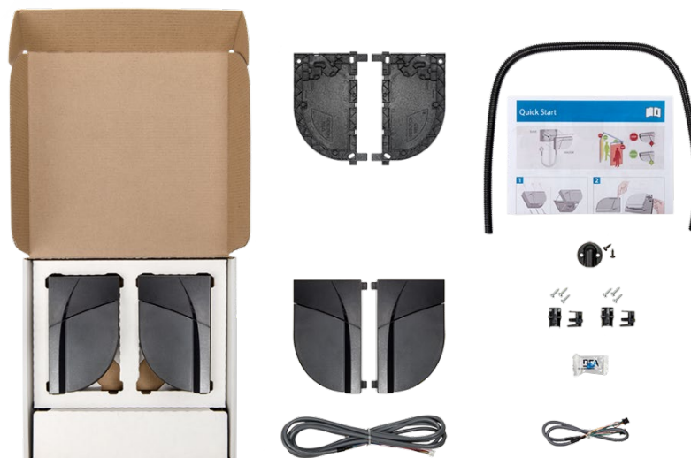
LZR®-FLATSCAN SW KIT EQUIPMENT