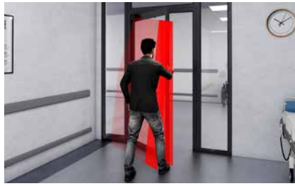
Extended safety area during closing