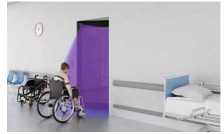
Opening function by approach