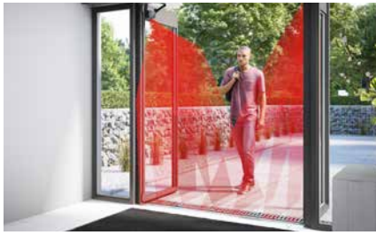
Independent from the floor type